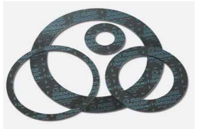
↑ Gaskets made from SIGRAFLEX UNIVERSAL PRO