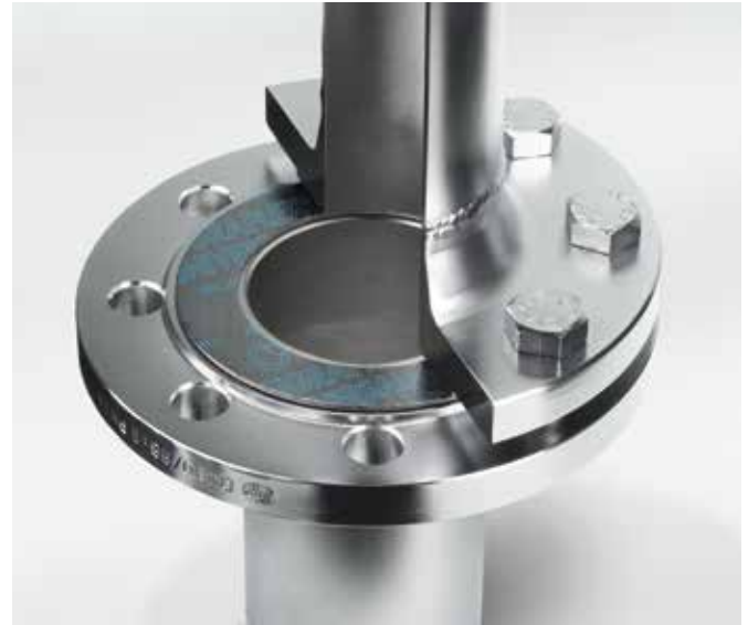
↑ Flange with SIGRAFLEX UNIVERSAL PRO gasket